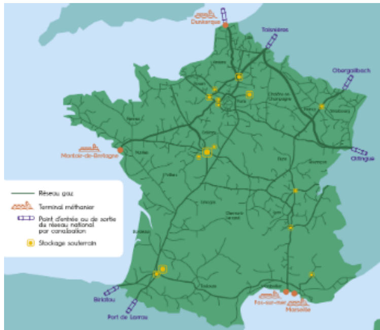
The French natural gas transmission network in 2019

CRE defines the gas transmission tariffs to avoid any cross-subsidisation between the different categories of transmission network users, particularly between users accessing the network for transit and those supplying domestic consumption. It also ensures the absence of cross-subsidisation between the two network categories, main and regional, by guaranteeing that the income received at each network corresponds to the expenses generated by their use.